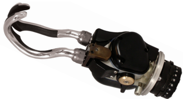
Figure 1: the ETD1, using 50's era APRL hook fingers, to create a combination of simple body-powered hook shapes, with a modern motor drive in a water-resistant package.

The slender hook design provides users with the ability to reach tight places and provides high manipulation as well as visibility of objects grasped. The 2-speed transmission provides a fast closing speed and high pinch force. Water resistant housings made the ETD1 highly functional working in wet and dirty environments, e.g., the kitchen, out-of-doors occupations from auto mechanic to farming, in addition to familiar Activities of Daily Living (ADLs).